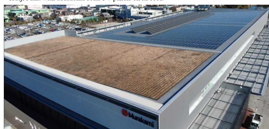
Tsuiji Plant with additional solar PV panels on its roof.

We will continue our efforts to expand the use of renewable energy and other initiatives that are friendly to the global environment.